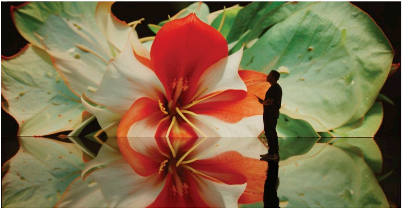
Living Archive: Nature showcases the output from the Large Nature Model (LNM) by Refik Anadol Studio.

R efik Anadol Studio in Los Angeles maintains a research practice centered around discovering and developing novel approaches to data narratives and machine intelligence. Since 2014, the studio has been working at the intersection of art, science, and technology to advance creativity and imagination using big data while also investigating the architecture of space and perception.