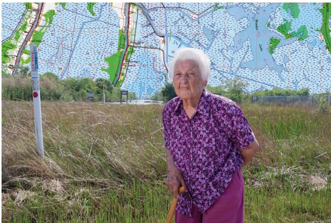
MONIQUE VERDIN Vivian Molinere Hotard : Pointe Barre : Lost Treasure Map , 2017, digital assemblage. Photograph taken in 2017; United States Geological Survey, Montegut, 1963 + 2015. Previous spread: Headwaters : Tamaracks + Time : Lake Itasca , 2019, digital assemblage. Photograph taken in 2019; United States War Department map of the route passed over by an expedition into the Indian country in 1832 to the source of the Mississippi River.