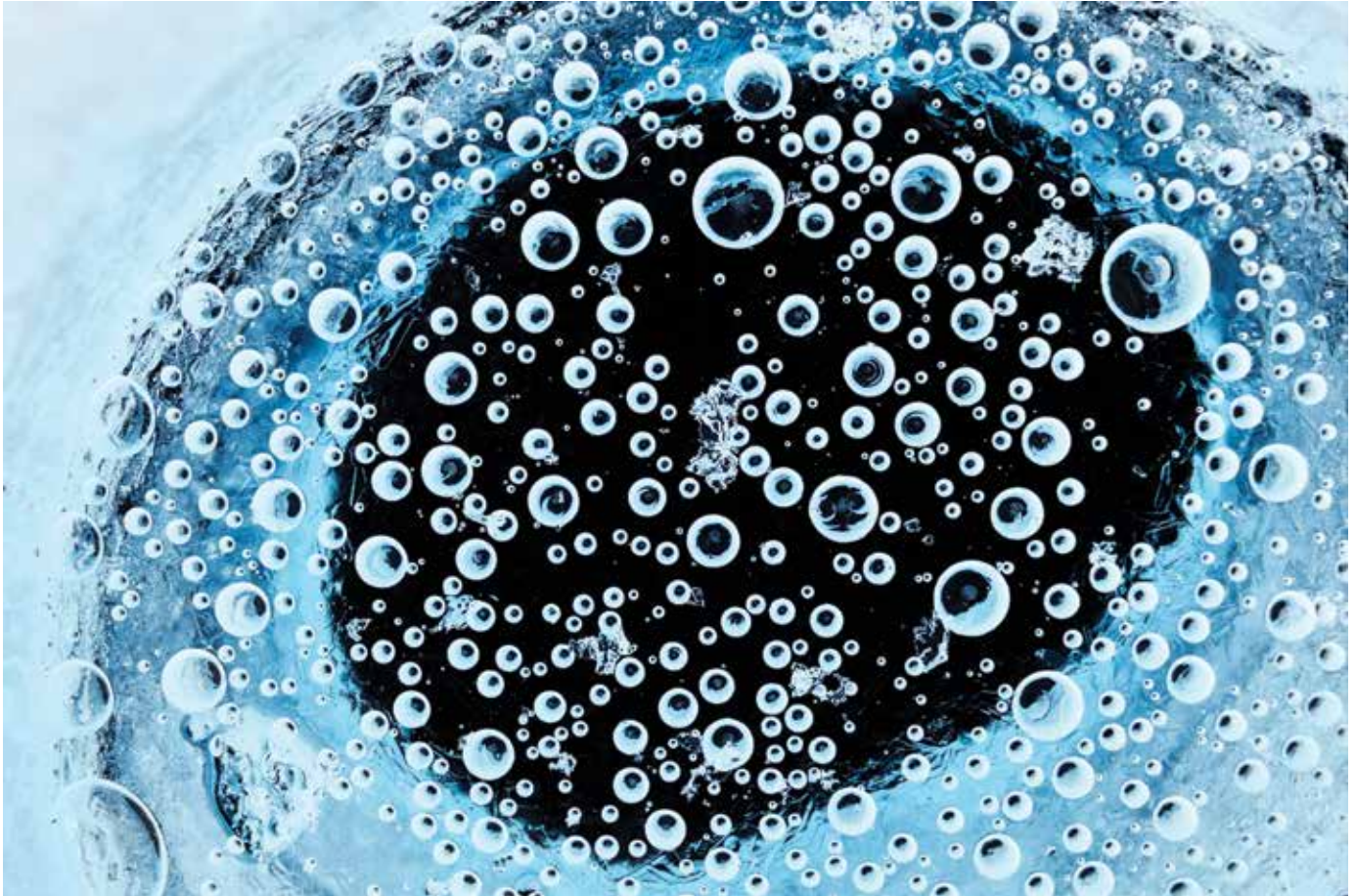
Ancient Air Bubbles Released By Melting of Greenland Ice Sheet, Greenland, 2008. Air trapped in ice more than 10,000 years ago is now being released as the Greenland ice sheet melts.