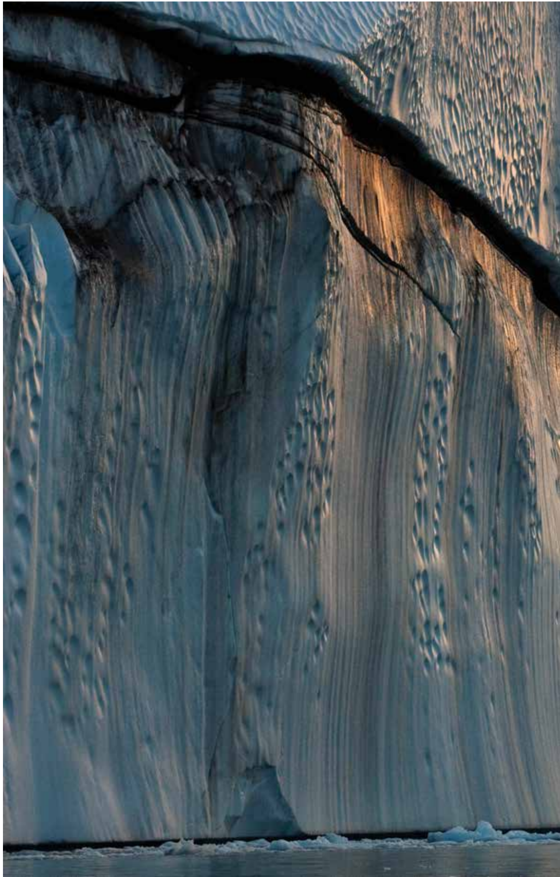
Copper Berg, Jakobshavn Isbræ, Greenland, August 24, 2007. Icebergs that have rolled over and been scalloped by waves metamorphose into fantastic shapes.