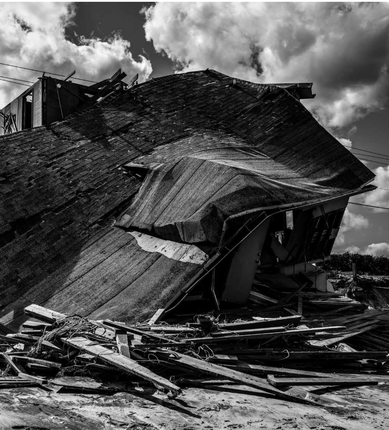
Crushed House after Hurricane Irma, South Ponte Vedra Beach, Florida, USA, September 12, 2017.