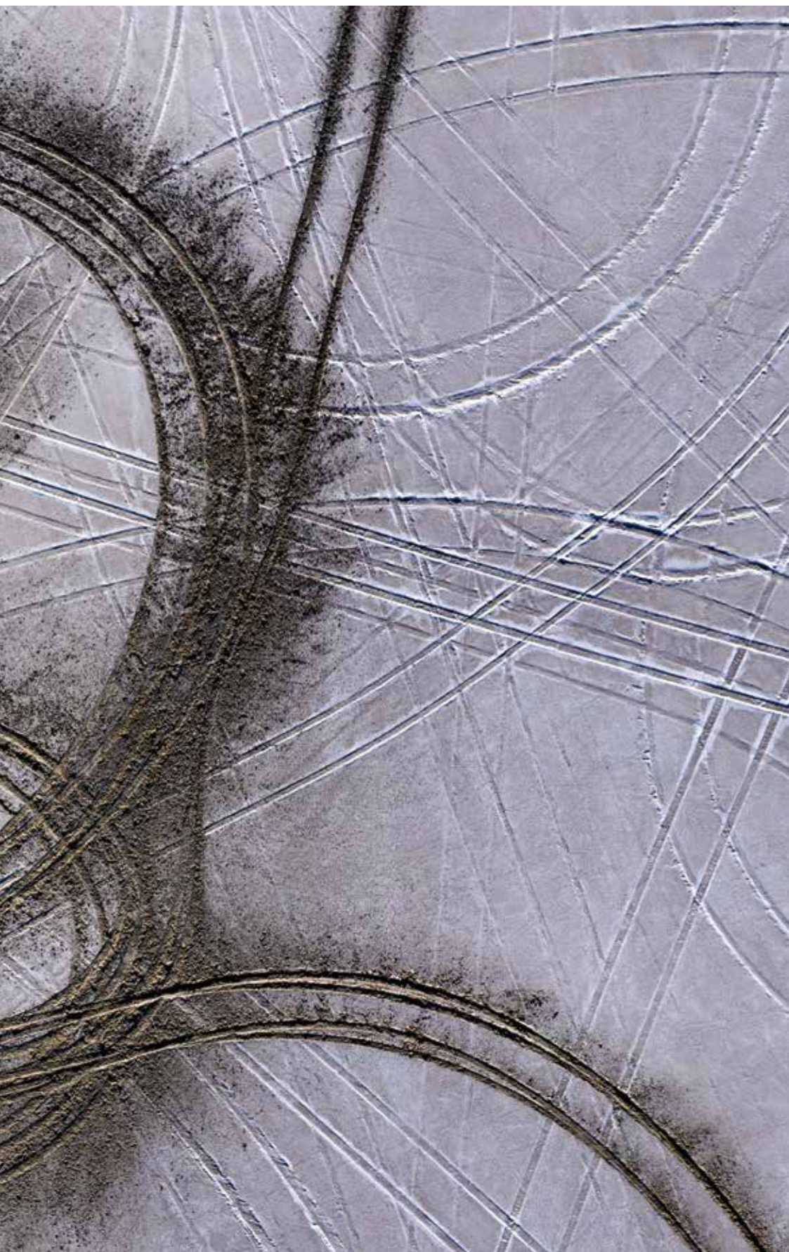
Tire Tracks, Bonneville Salt Flats, Utah, USA, 2019. The Bonneville Salt Flats are a densely packed salt pan in Tooele County in northwestern Utah. The area is a remnant of the Pleistocene Lake Bonneville and is the largest of many salt flats located west of the Great Salt Lake.