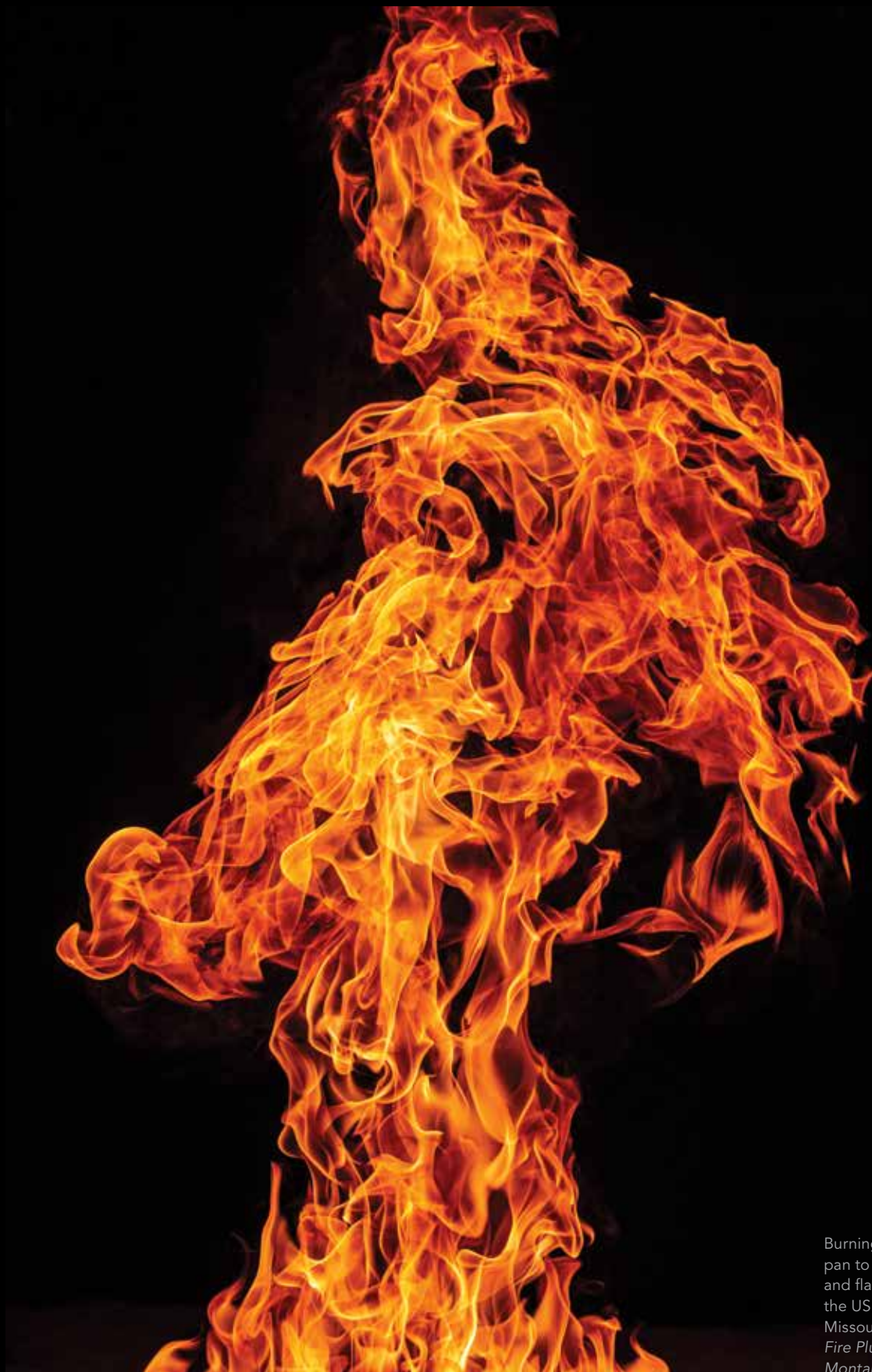
Burning ethanol in a steel pan to study flame dynamics and flame buoyancy at the US Forest Service's Missoula Fire Sciences Lab. Fire Plume #1, Missoula, Montana, USA, 2015.