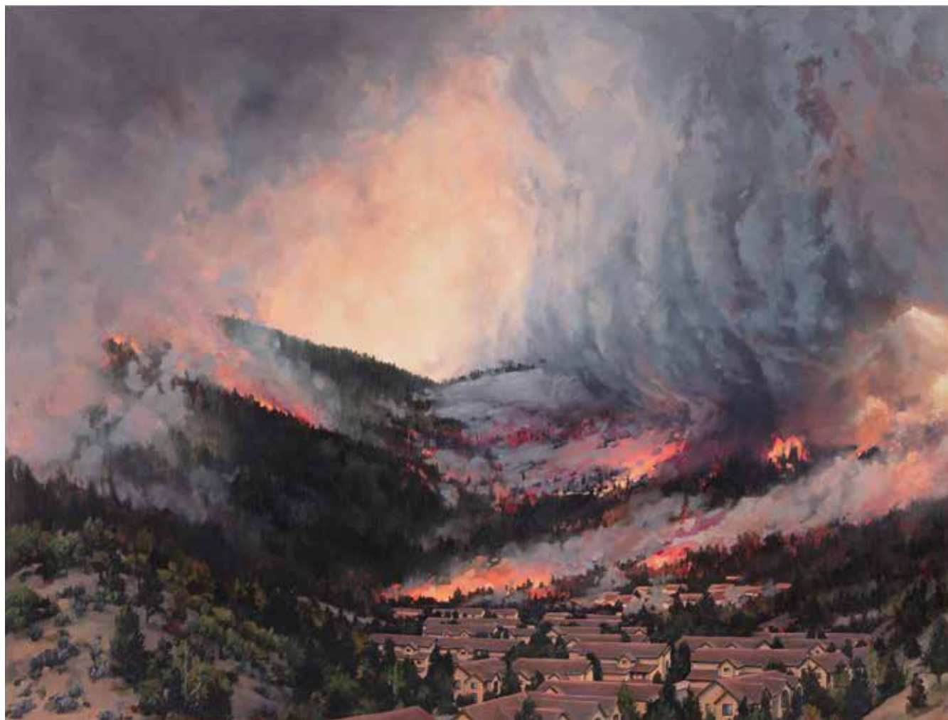
ERIKA OSBORNE, On the Edge of Sublime , 2015, oil on linen, 36 x 46 inches.

Erika Osborne depicts a wildfire in part of the wildland-urban interface, the transition zone between wildlands and human development. In recent decades millions of people have settled in these zones in California. Communities living in these expanding areas are at the greatest risk of experiencing catastrophic wildfires, partly because they are adjacent to vegetation that can fuel fires and partly because humans often ignite fires.