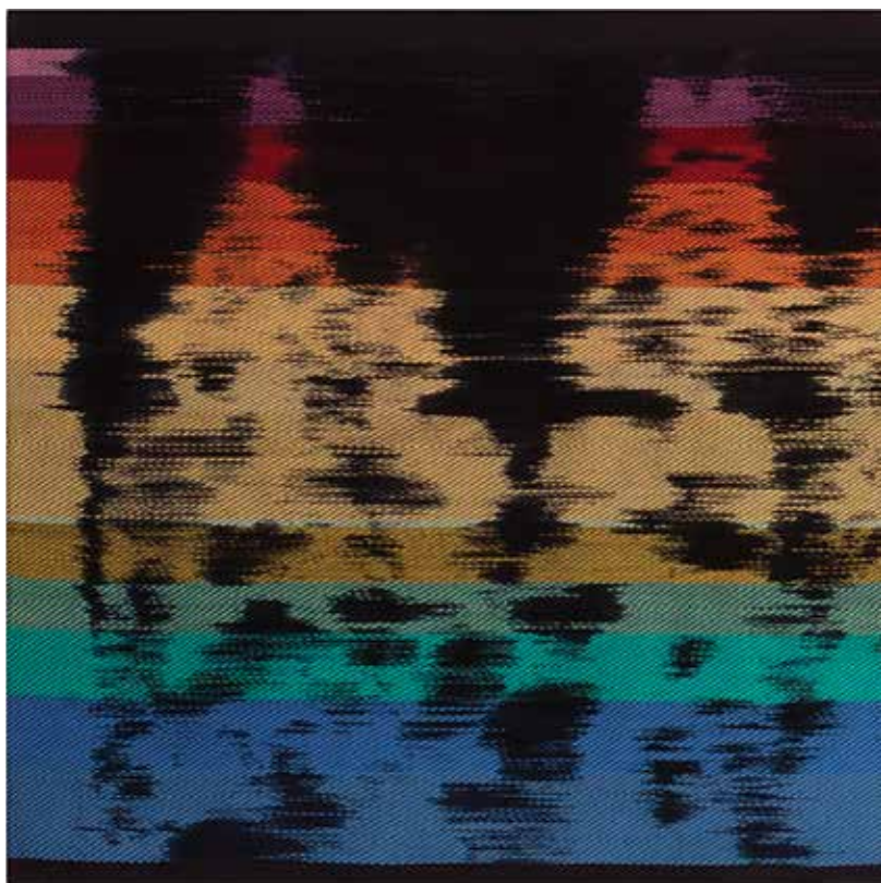
JORIE EMORY, Sierra LIDAR , 2021, handwoven textile, painted cotton, 70 x 24 inches. Commissioned for FOREST≠FIRE.

A major policy implication from our research is that for wildfire planning and response, policymakers need to think beyond just property values. Current disaster policies render many minority and poor communities invisible. Moreover,